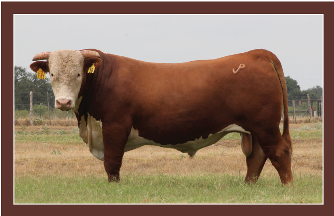
LOT 18 · JP 3063 DOMINO 7173

•EPDs - BW +0.8 WW +43 YW +79 Milk +26 M&G +48 REA 13.97 %Fat 3.84