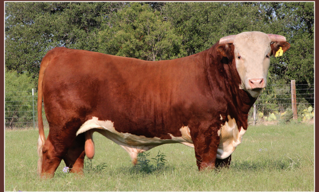
LOT 1 · JP 4065 DOM 7115

•EPDs - BW +0.4 WW +61 YW +88 Milk +28 M&G +59 REA 14.99 %Fat 3.55