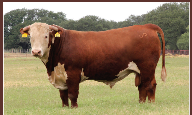
LOT 22 • JP 334 DOM 7180

•EPDs - BW +5.5 WW +61 YW +96 Milk +27 M&G +58 REA 15.7 %Fat 2.35