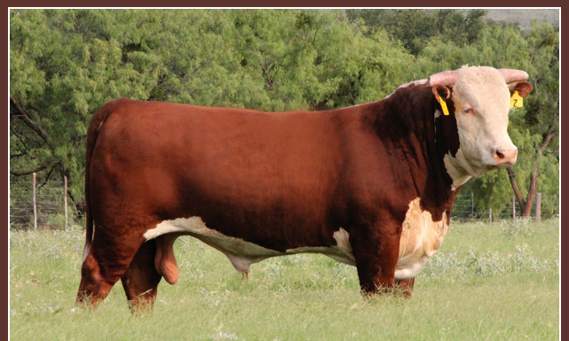
LOT 2 · JP 9166 HARLEY 7058

•EPDs - BW +2.4 WW +55 YW +82 Milk +26 M&G +53 REA 15.6 %Fat 3.32