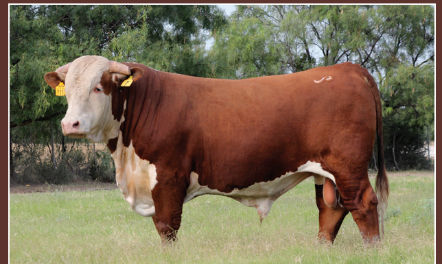
LOT 7 · JP 2206 RIBSTONE 7112

•EPDs - BW +3.9 WW +48 YW +75 Milk +25 M&G +49 REA 13.59 %Fat 3.23