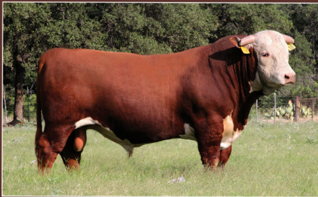
LOT 10 · JP HARLAND 7110

•EPDs - BW +0.1 WW +42 YW +69 Milk +25 M&G +46 REA 13.66 %Fat 3.21