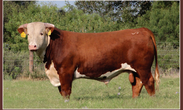
LOT 6 · JP HARLAND 7076

•EPDs - BW 4.3 WW +59 YW +97 Milk +20 M&G +50 REA 14.57 %Fat 3.3