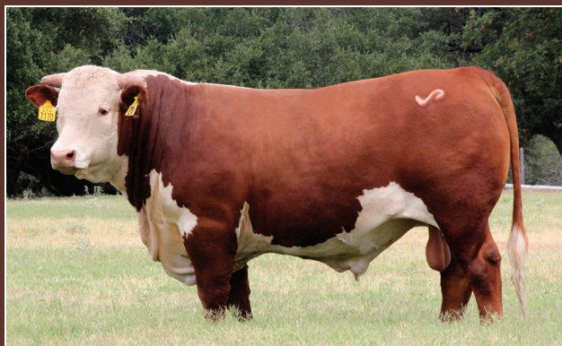
LOT 28 · JP 334 DOM 7170

•EPDs - BW +5.9 WW +64 YW +103 Milk +25 M&G +57 REA 14.86 %Fat 4.22