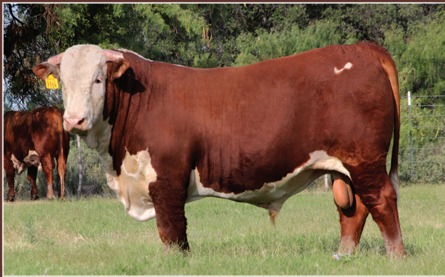
LOT 5 · JP 4615 GOLD 7154

•EPDs - BW +3.6 WW +53 YW +81 Milk +22 M&G +49 REA 15.05 %Fat 3.57