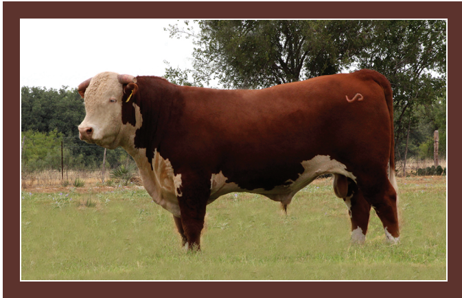
LOT 20 • JP 4065 DOM 7190

•EPDs - BW +1.4 WW +54 YW+75 Milk +23 M&G +50 REA 12.99 %Fat 3.61