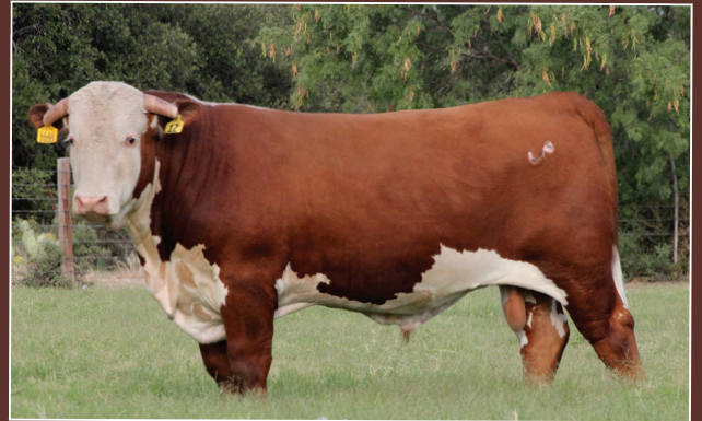
LOT 12 · JP 4065 DOM 7095

•EPDs - BW 4.9 WW +68 YW +99 Milk +23 M&G +57 REA 13.26 %Fat 2.54