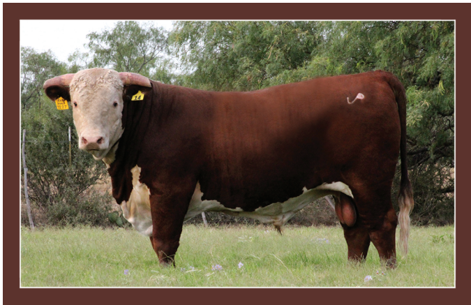
LOT 14 · JP 3036 DOMINO 7227

•EPDs - BW +3.6 WW +51 YW +94 Milk +25 M&G +51 REA 13.33 % Fat 2.77