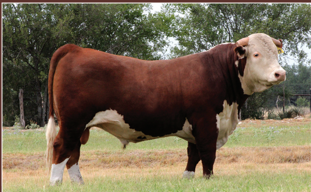
LOT 29 · JP HARLAND DOM 7166

•EPDs - BW +7.6 WW +58 YW +101 Milk +27 M&G +56 REA 14.13 %Fat 3.34