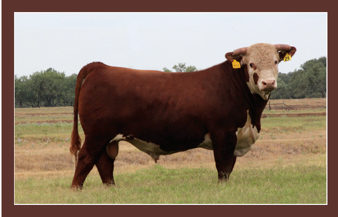
LOT 23 · JP 4065 DOM 7111

•EPDs - BW +4.2 WW +57 YW +88 Milk +22 M&G +51 REA 14.72 %Fat 3.35