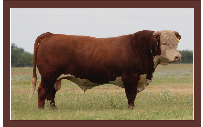
LOT 26 · JP 9166 HARLEY 7064

•EPDs - BW +4.2 WW +54 YW +84 Milk +30 M&G +57 REA 12.97 %Fat 3.49