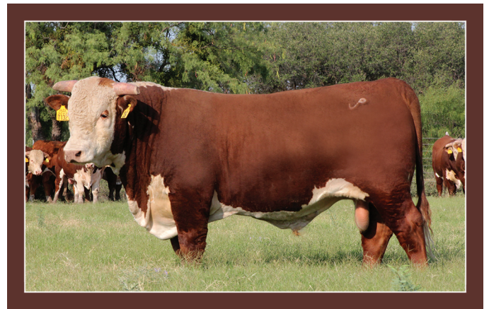
LOT 16 · JP 3063 DOMINO 7132