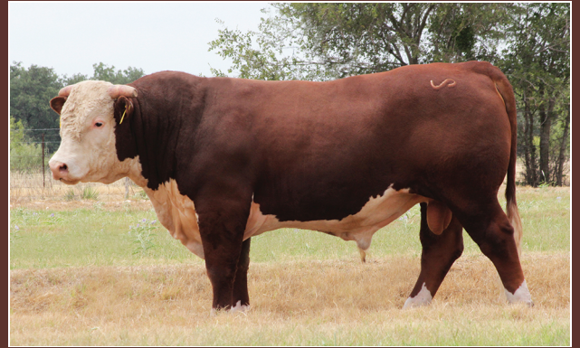
LOT 21 • JP 3063 DOMINO 7161

•EPDs - BW +2.2 WW +45 YW +80 Milk +25 M&G +47 REA 15.8 %Fat 2.72