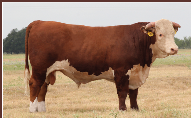
LOT 31 · JP 4065 DOM 7230

•EPDs - BW +3.8 WW +54 YW +84 Milk +22 M&G +49 REA 13.2 %Fat 2.55